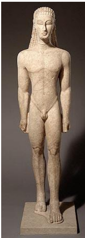
Fig. 1 Kouros. c. 600 BCE

The conquest of primitive cultures does not find echo in the artistic creations of the ancient Romans. Primitive rural life in the outer reaches of the Empire is not etched into the walls of Roman villas. The Romans did, however, assimilate the artistic creations of other civilised cultures, even to the extent of being accused of copying the art of the conquered. The other, kinder, argument is that the Romans were more eclectic in their art, allowing themselves to be influenced by other cultures. Art does not fall from the sky – it is always a social product, and, in some sense, it is always derivative. The Romans, while engaging in artistic activity, would have been well aware of their surroundings. These surroundings would have influenced the choice of themes to depict while taking into account the wishes of their patrons.